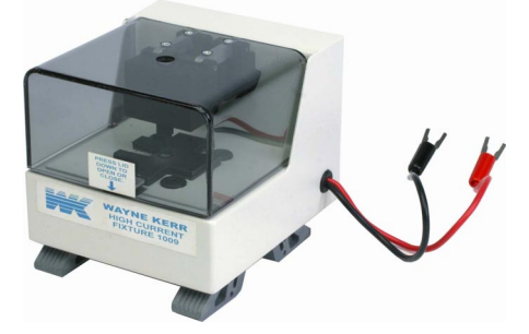
1009 DC Bias Fixture enables currents up to 50 A to be applied to an SMD inductor

Stable component fixturing ensures high accuracy and repeatable measurements. Enclosed fixtures, with safety interlocks, minimises risk to operators.