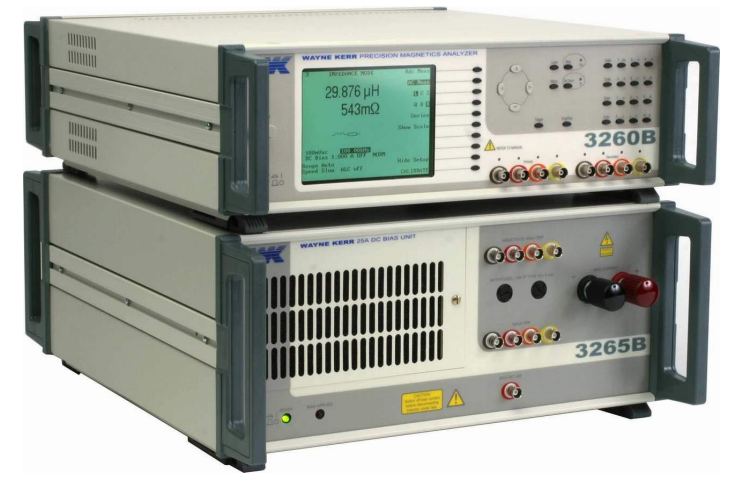
3265B DC Bias Unit can deliver up to 25 A of DC bias current in steps of 0.025 A

The 3265B has a number of safety and protection features including a safety interlock system to protect the user against back EMFs. It is also fully protected against over temperature, excess voltage drop and sense lead failure.