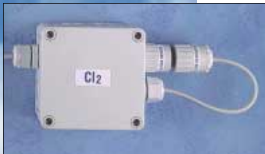
Transmitter with auto-test