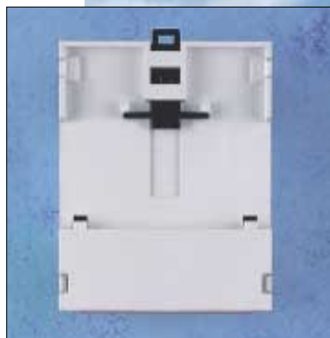
DIN rail mounting