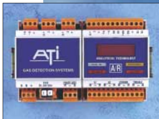
Power supply & receiver