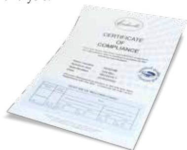
Certificate of Compliance Supplied with every test sieve

Endecotts test sieves are of the highest quality and are designed for accurate and efficient particle analysis.