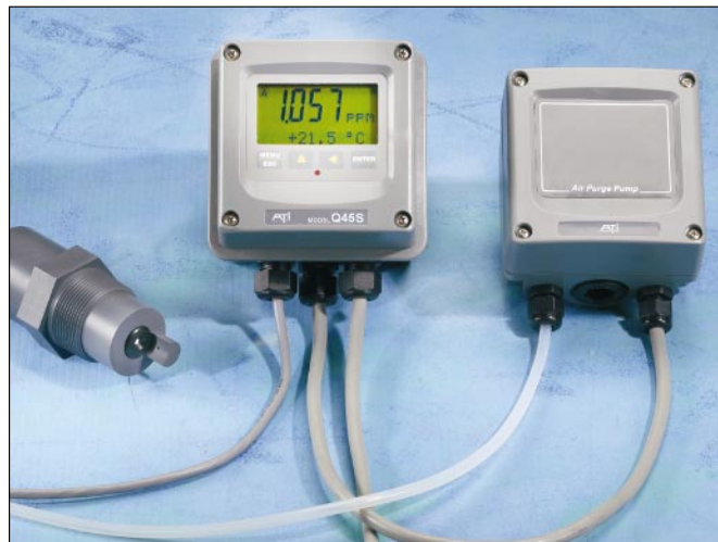
Q45S Monitor and Sensor

A special battery-powered version of the Q45S is available for use in temporary installations. This system runs on an internal 9 volt