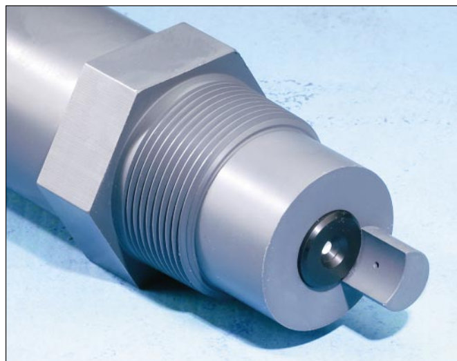
An optional air-purge system controlled by the transmitter will periodically deliver a blast of air across the critical sensor surfaces to remove water droplets.

battery and contains a data-logger for collecting information on existing air collection systems. A standard 9 volt battery will operate the unit for 4 days, while a 9 volt lithium battery will provide about 10 days of operation. Data is easily downloaded to a standard PC using software supplied with the unit.