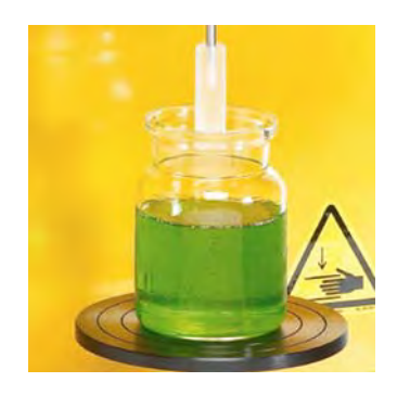
TA-10 (uses rotary table) GMIA & GME Bloom Probe and

Bi-Layer Shear Fixture is used for evaluating the performance of tablets to ensure controlled release when swallowed and strength through the product packaging process.