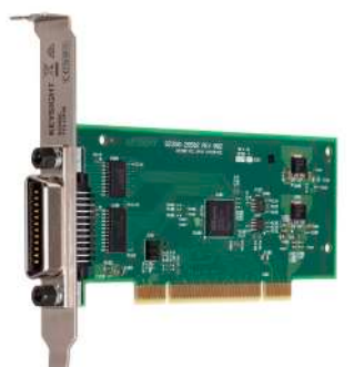
82350C with standard profile bracket

The 82350C interface card is fully compatible with IEEE-488 control and communication standard, de-couples GPIB transfers from PCI bus transfers. Buffering provides I/O and system performance that is superior to direct memory access (DMA). The hardware is software configurable and compatible with the plug-and-play standard for easy installation. The GPIB interface card offers high flexibility to plug into standard or low profile PC with a bracket change.