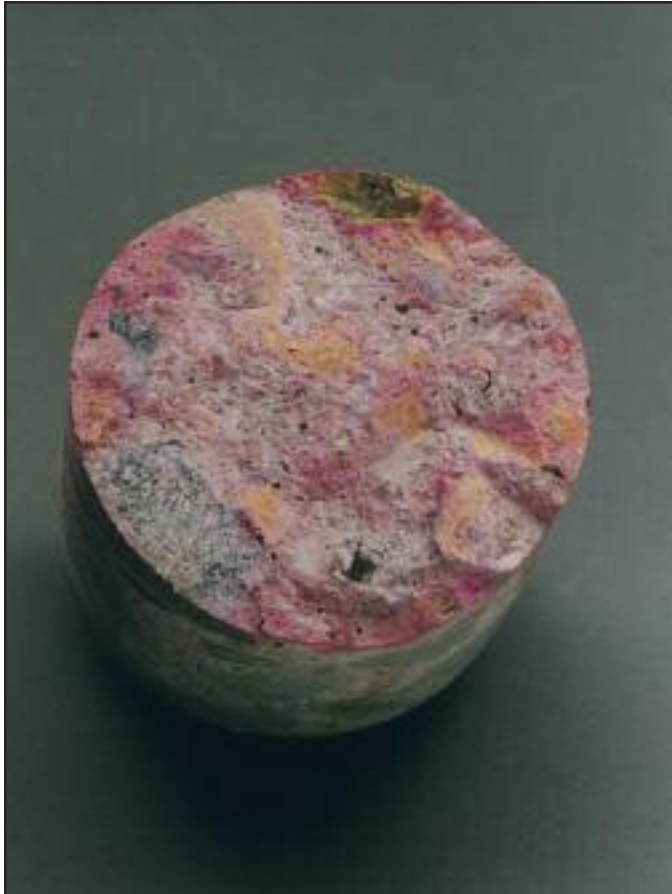
Concrete Core Showing Advanced ASR