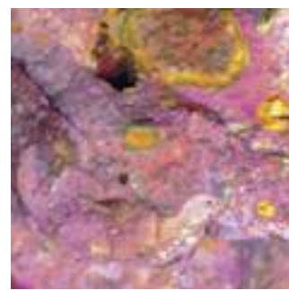
Concrete tested with pink and yellow gels showing both beginning and advanced stages of ASR.