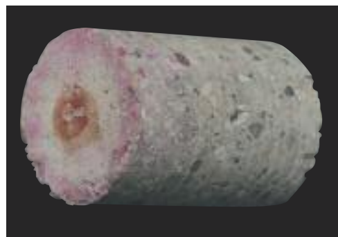
Concrete Core showing uncarbonated area at the left

Care should be taken to prevent drilling and coring dust from contaminating the surface to be tested.