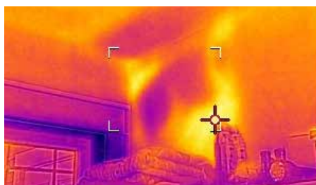
See temperature patterns showing insulation voids and other building issues