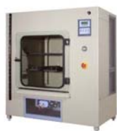
Vertical Salt spray chambers.