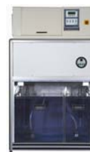
SOLARBOX R.H. with Humidity Control

We reserve the right to make changes to equipment and systems in response to advances in technology and modify parameter values accordingly.