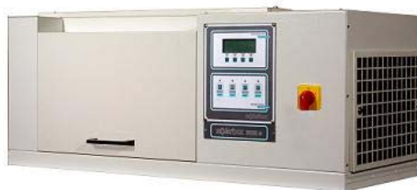
SOLARBOX 3000 E

Consequently, because the temperature produces an accelerated ageing, it is essential to be able to control of B.S.T. during exposure to filtered Xenon radiation.