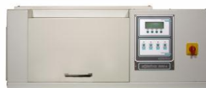
Solarbox 3000 e