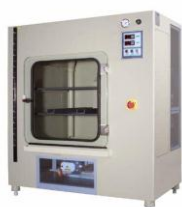
Corrosionbox 400 I