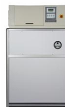
Solarbox 3000 RH

We reserve the right to make changes to equipment and systems in response to advances in technology and modify parameter values accordingly.