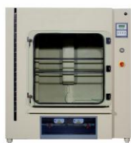
Corrosionbox 1000 I