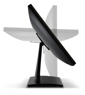
90-degrees of Adjustment