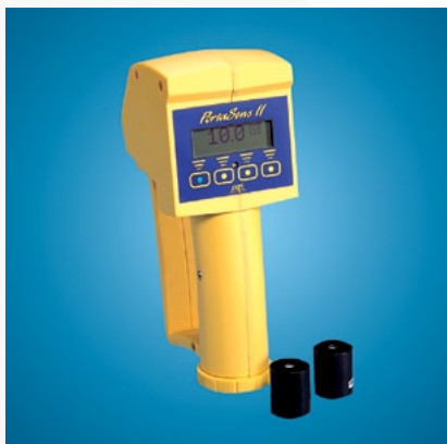
Portable H 2 O 2 Gas Detector

ATI also offers a loop-powered dissolved peroxide monitor for those applications where extra outputs and/or relays are not required. A battery powered portable unit is also available with an internal data logger for temporary monitoring applications. And for safety around your peroxide system, ATI manufactures a variety of portable and fixed point gas detectors.