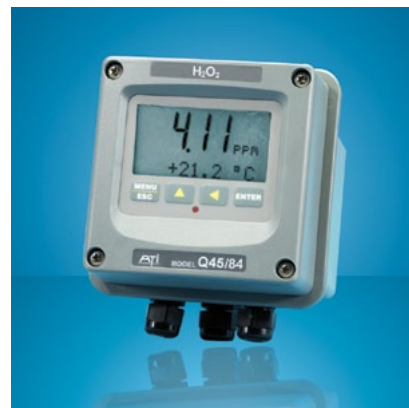
H 2 O 2 Loop-Powered Transmitter