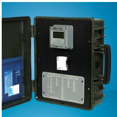
PQ45 Portable H 2 O 2 Data Logger