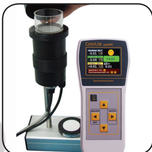
Measuring set inhomogeneous samples

The sph870 is a user-friendly, portable spectrophotometer with a 45^{\circ}/0^{\circ} geometry, which due to the wide range of accessories available is suitable for a variety of surfaces and materials. For example, the system can be easily changed from the 45^{\circ}/0^{\circ} to a d/8^{\circ} geometry simply by using our MA35 probe head adapter. The high-resolution technology enables a spectral scan in 3.5 nm steps in just 0.5 seconds. The menu is simple and well arranged, so that even untrained staff can perform the measurement task fast and accurate.