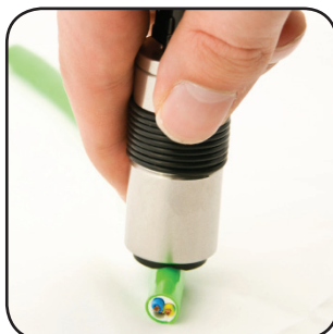
Probe head with v-block for cylindrical samples