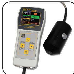
sph870 with measuring head MA35