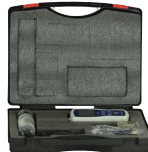
FG-7000T with Included Accessories and Carry Case