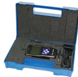
FG-3000 with Accessories in Protective Carrying Case