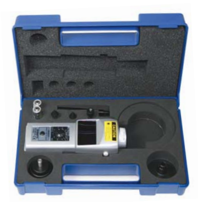
Standard DT-200LR in Supplied Case