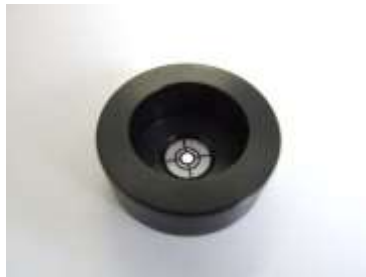
Target device for measurement area: 1.5, 4 or 6mm