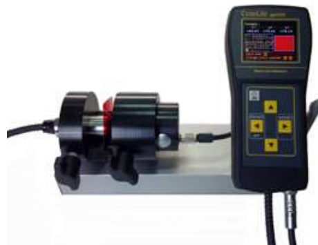
CA10 – UK Adapter Transparent and translucent liquids and films