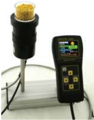
MA38-Set for measuring samples