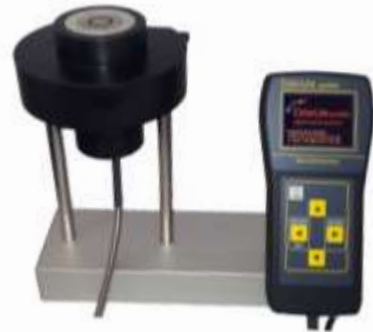
Holder MA35 -UP