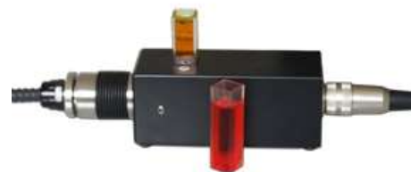
CA10 – LS Adapter