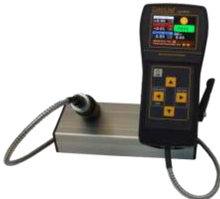
Holder standard probe head 45°/0°