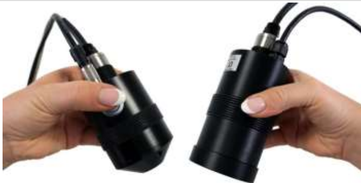
MA35- d/8° adapter 3, 6 and 10 mm area