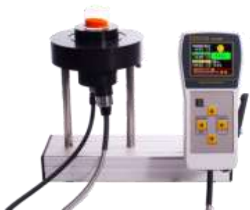
Stand MA35-UK-UP for supporting the probe