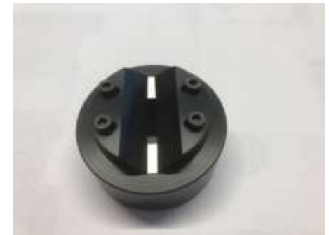
Aperture with adjustable prism for rounded samples