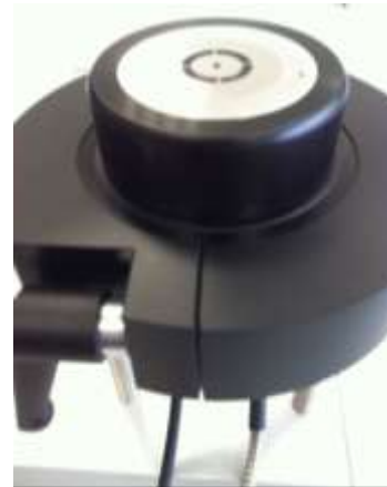
Aperture for measurement area 2 mm