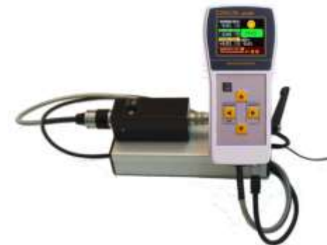
CA10-LS set with holder