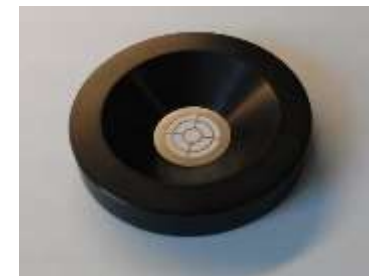
Target device for measurement area: 1.5, 4 or 6mm