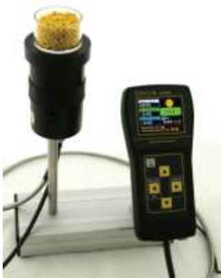
MA38 set – d/0° adapter 38 mm area