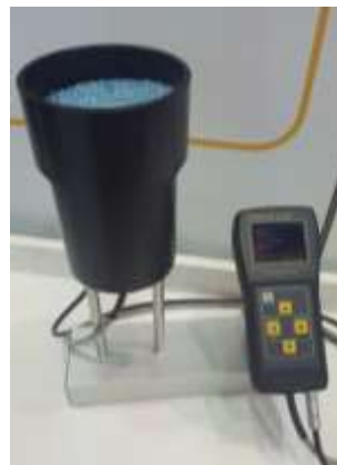
MA80 set – d/0° adapter 80 mm area