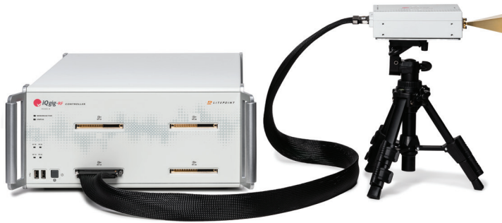
IQgig-RF Test System 1

IQgig-IF is a compact test system, which supports the same WiGig measurements as the IQgig-RF, but uses conducted testing in the baseband module frequency bands. It is designed for 4.9 to 19.4 GHz, covering the wide ranges of major chipset companies' proprietary IF frequency ranges. By sharing the same test platform—an intuitive GUI and automated test solution—IQgig-RF and IQgig-IF are complementary WiGig test solutions that provide a simple data correlation and ensure high quality in all of your WiGig testing needs.