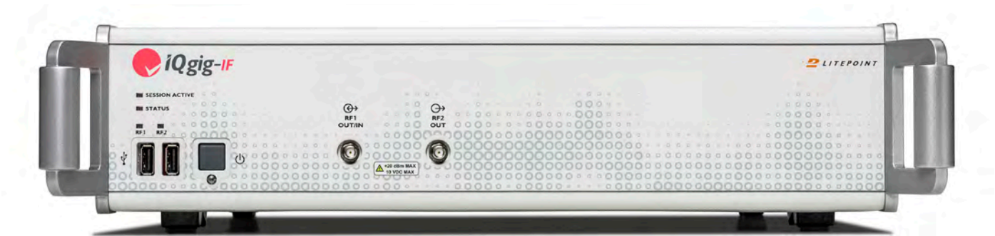
IQgig-IF Front Panel