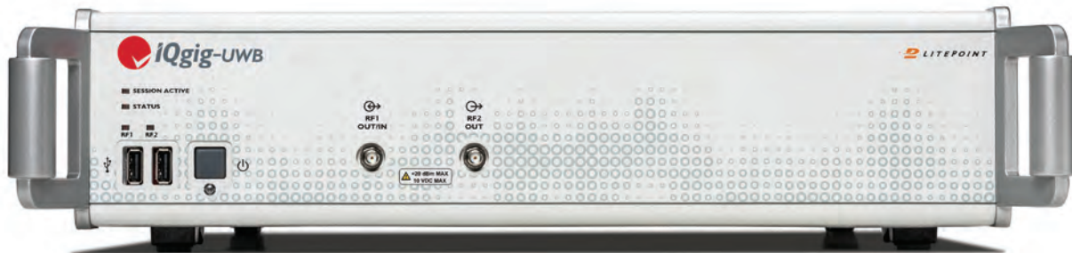
IQgig-UWB Front Panel