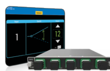
MEMS optical switch FTBx-9160 [1x2, 1x4 configuration]