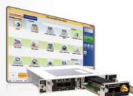
100G multiservice test module FTBx-88260/FTBx-88200NGE