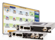
10G multiservice test modules FTBx-8870/8880