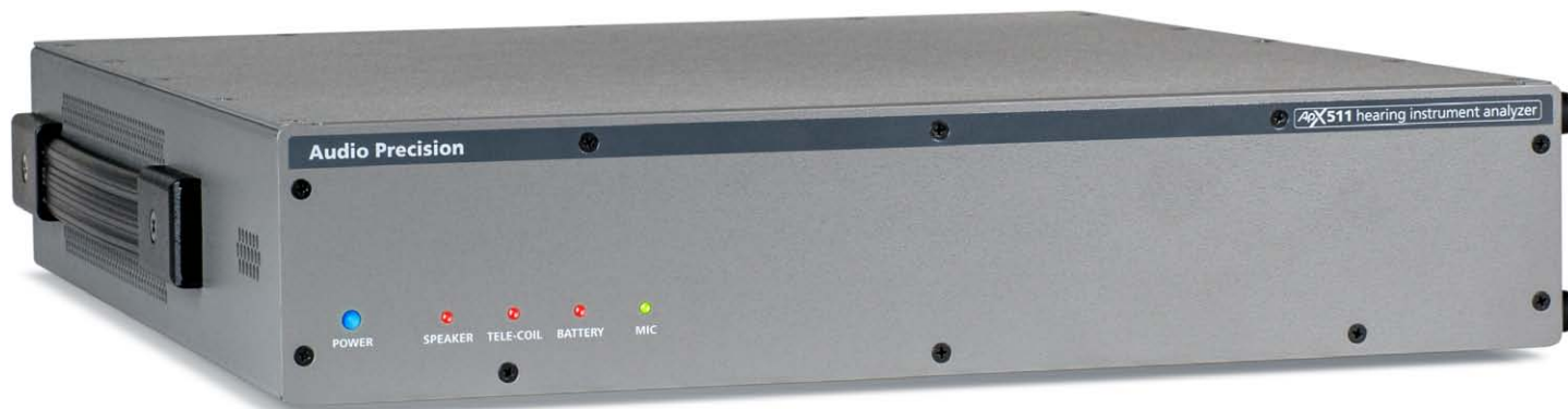
APx511 audio analyzer for hearing instrument production test

AP performance for hearing instrument production test