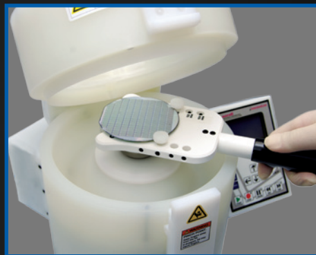
Wafer Alignment Tool Shown

Our exclusive Back-Pack design allows you to add features such as automatic dispense, or Edge Bead Removal on site, without returning your system to the factory!