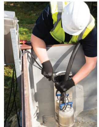
DS FilterSepta Mk 2 05.19