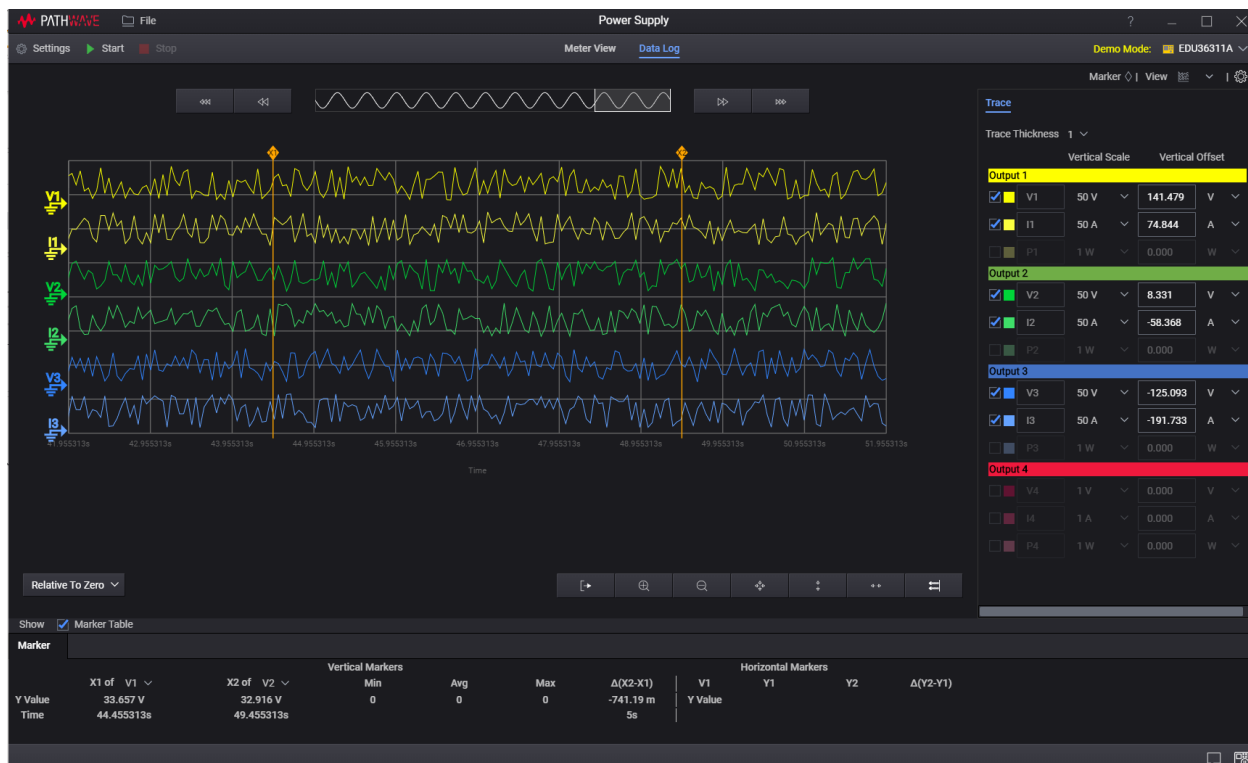
Figure 3. Data-logging with PathWave Benchvue software for the PC