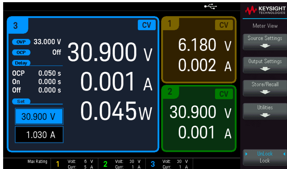
Figure 2. View details of a single channel including the measured power, OVP/OCP condition, and delays.

Figure 2 shows the single-channel view that includes the measured power, OVP / OCP condition, and delays. You can also monitor the readback, voltage and current for the other two channels.