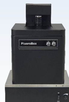
Use with UV illuminator