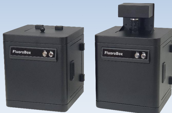
Non camera model

FluoroBox is a device that images DNA electrophoresis gel and analyzes. FluoroBox Blue is optimized for the reagents, wavelength of 450nm~490nm, that is invented alternative to EtBr. It consists of LED light and dark room chamber. FluoroBox can also be used in conjunction with UV transilluminator. Compact size and simple design has satisfied user's convenience. Gel can be observed through the window at the top and gel cutting can be done conveniently through the doors at each side. Our simple program enables users to obtain results easily and simply quantify the DNA band.