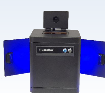
Side door for gel cutting