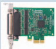
PX-260: LP PCIe 4xRS232 1MBaud