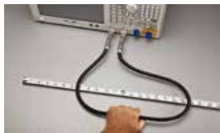
Cable is pulled off center 10° in both directions

** Phase stability data IAW Times' phase/flex test criteria as demonstrated above.