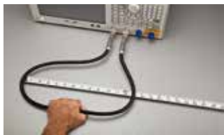
Flex Test (one full cycle)