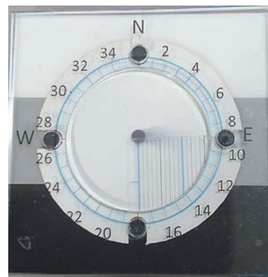
Ruler for trailing read