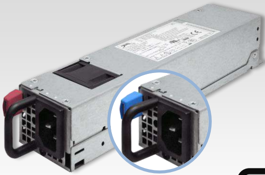
TG20-1100-01 Airflow Out TG20-1100-02 Airflow In