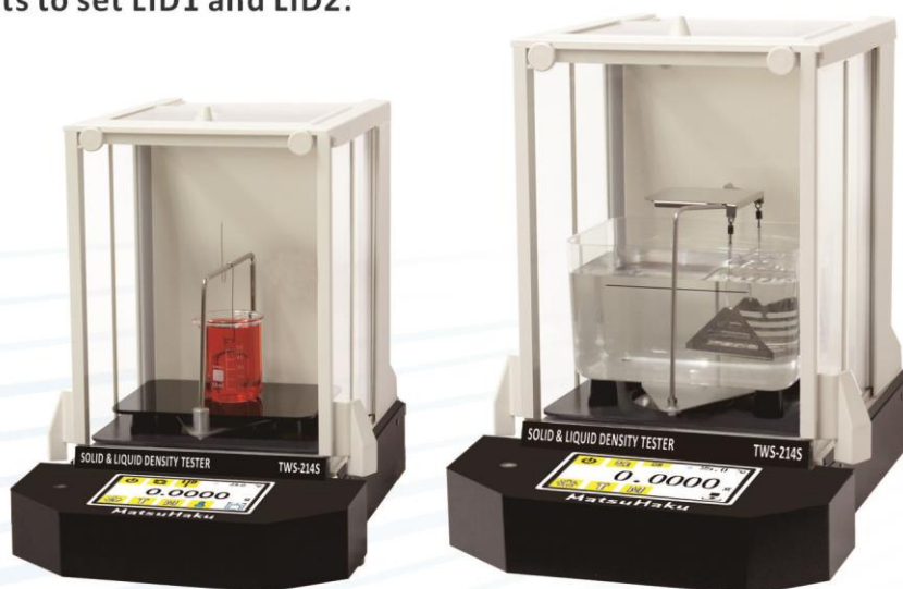
TWS-214/215S - Liquid type TWS-214/215S - Solid type

2. Liquid density measuring mode LID 2 – measuring density and concentration of liquid of the second group.