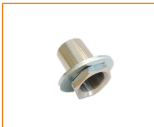
Extension nut to be used on LPCA with long screw enabling installation thickness 25-50mm