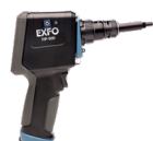
Fiber inspection scope FIP-500