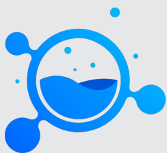
MaxiFlow Nitrogen Generator