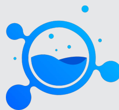
MaxiFlow Nitrogen Generator with integrated compressor