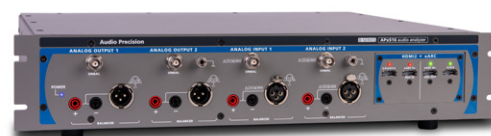
APx516B with HDMI2+eARC digital audio module

Software licensing options provide APx users several choices for accessing new software releases. Perpetual licenses are available via the SW-EXT (new analyzers) or SW-MAINT (existing analyzers) options. .