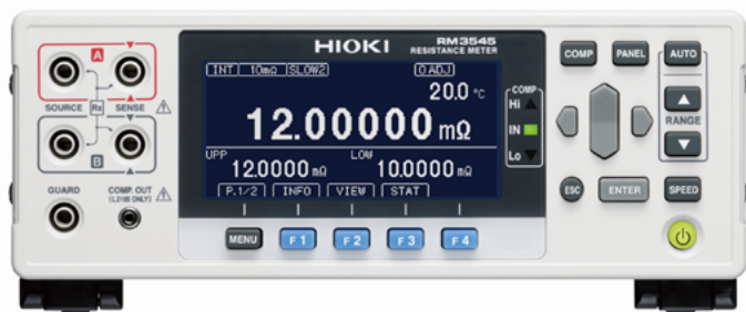
Figure 1: HIOKI RM3545 Resistance Meter

That's why the "smallest" bench resistance meter from HIOKI - the RM3544 - has a lowest resistance range of 30mOhm. Its "bigger brother", the RM3545 , has a lowest resistance range of 10mOhm and a resolution of just 0.01 \mu Ohm.