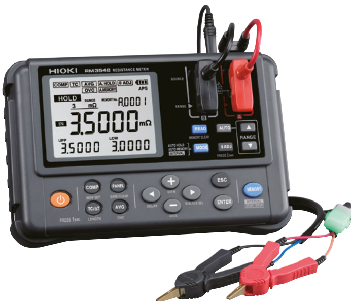
Figure 6: The portable resistance meter RM3548 from HIOKI

The RM3548 doesn't feature a guard terminal, as this portable resistance meter is typically used for lower resistances. Lower resistances mean that predominantly higher measurement cur-