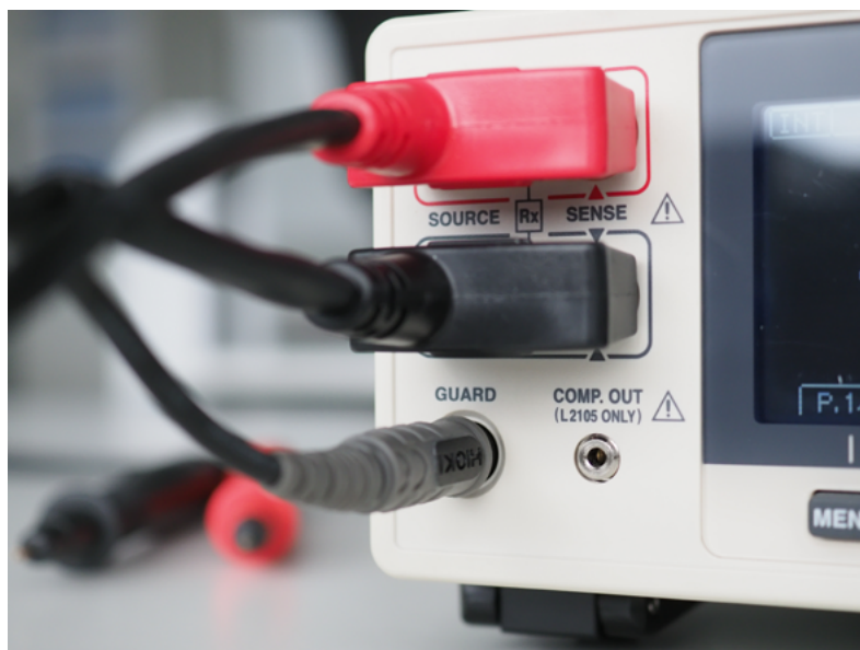
Figure 4: Guard terminal: More stable measurements in high resistance ranges

Technically the guard terminal allows to "ground the shield" of the test lead. The guard terminal is supported in HIOKI's test leads L2101 , L2102 , L2103 and L2104 . Of course you can also use test leads with the RM3544 and RM3545 that don't connect to the guard terminal, such as HIOKI's test leads L2100 or L2107 . Especially when you intend to measure small resistances then the test currents are high and the impact of noise is low. But again, especially in the MOhm resistance ranges not using the guard terminal can impact the measurement results.