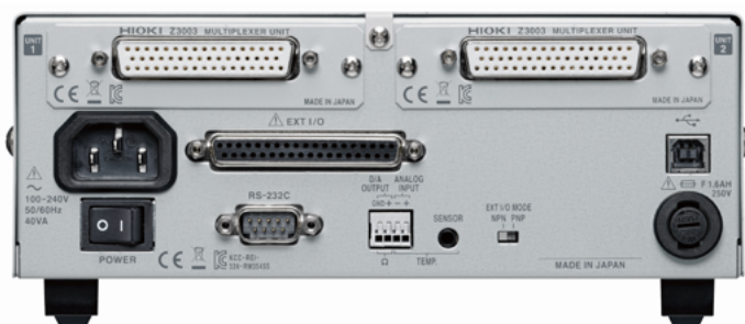
Figure 2: Backside of RM3545-02 (including two Z3003 multiplexer cards)

A very useful function - which is hard to find even in top of the range multimeters - is a contact check function: If activated, a measurement is only started after ensuring that the probe has proper contact to the device under test. This is a feature surely not critical in a lab environment, but really useful in production environments where it helps to avoid rejects caused by poor contact of the probe to the DUT. N.B.: The contact check function is featured in the RM3545 , but neither in the RM3544 nor the RM3544-01 .