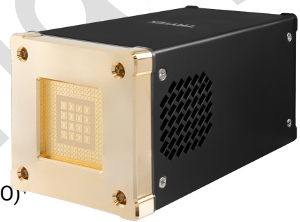
Figure 1. BBox™ One 5G 26 GHz