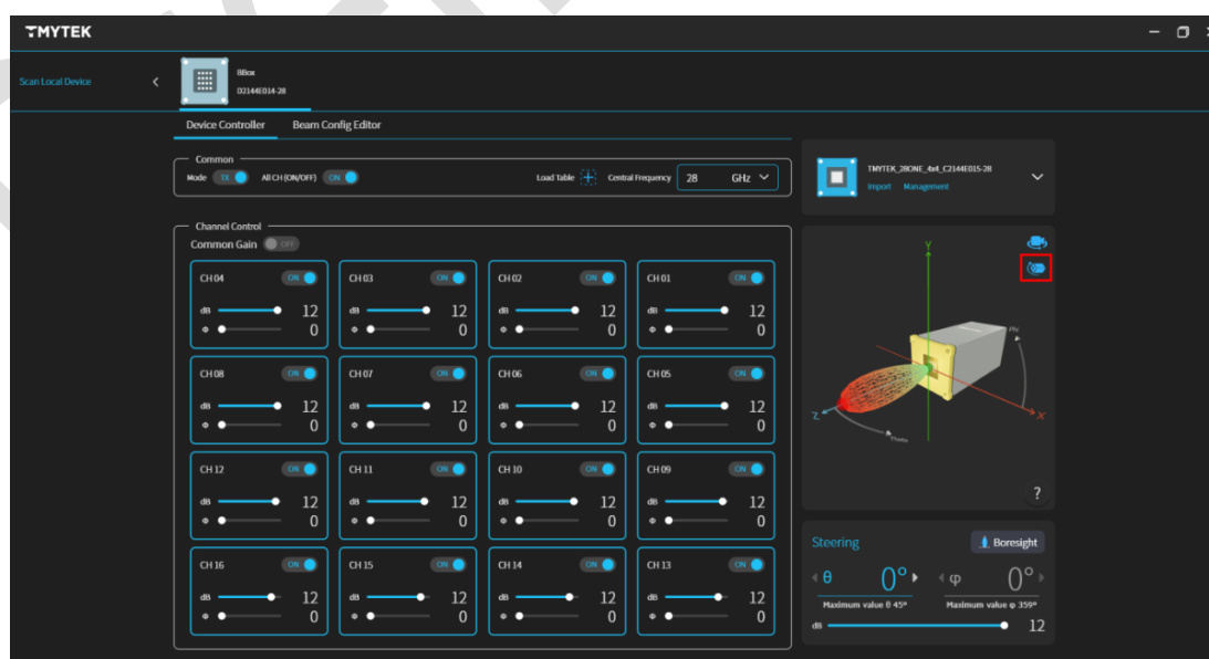
Figure 3. TMXLAB Kit – Software GUI for controlling BBox™ One

The BBox™ One software interface offers both UI and API control which are completely designed in house by our software team. Our patented software algorithm offers better accuracy and easier control on the beam angles. The module can be controlled either by RJ-45 ethernet cable or USB cable. Both the UI and API are available for our customers to access and download from the Web. The user interface shows the 16-channel phase and amplitude control block diagram as depicted below. To control the parameters, please drag the dB and \Phi slide bars on the desired channel to make the changes. The left portion of the interface shows the beam steering angle. This can be used together with our standard antenna kit to control the steering angle.