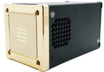
Figure 1. BBox™ One 5G 28 GHz