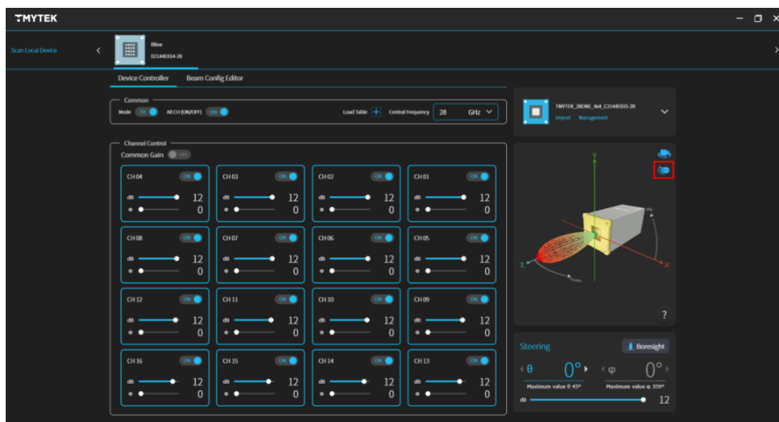
Figure 3. TMXLAB Kit – Software GUI for controlling BBox™ One

The BBox™ One software interface offers both UI and API control which are completely designed in house. Our patented software algorithm offers better accuracy and easier control on the beam angles. Both the UI and API are available for our customers to access and download from the link . The user interface shows the 16-channel phase and amplitude control block diagram as depicted below. To control the parameters, please drag the dB and \Phi slide bars on the desired channel to make the changes. The left portion of the interface shows the beam steering angle. This can be used together with our standard antenna kit to control the steering angle.