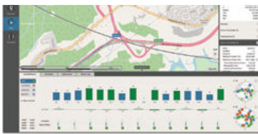
Some of its many innovations include a user-friendly interface, powerful and documented API, and intuitive automation tools.