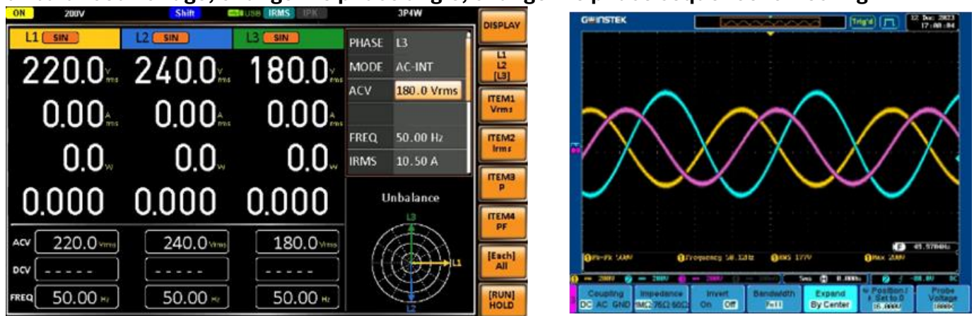
Figure 2: GW Instek ASR-6000 series AC power supply outputs unbalanced three-phase voltage display (left), and the oscilloscope measures the output waveform (right)

The above applications require three-phase AC power supply to provide three-phase unbalanced voltage; change the phase angle; change the phase sequence for testing.