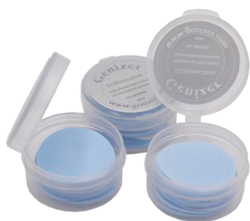
Track-Etched Liposome Membranes (19mm)