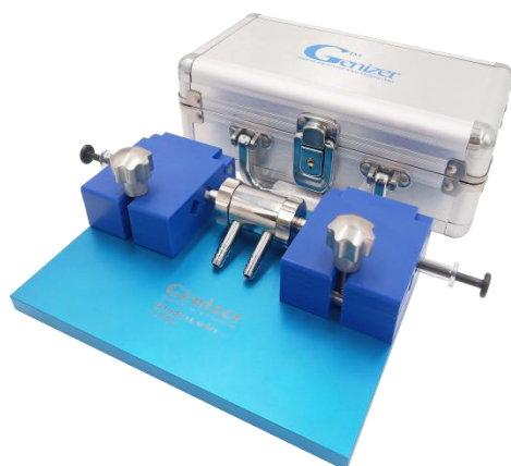
HnadExtruder-RT (Packed with Genizer Box)