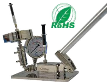
Homogenizer with Extruder