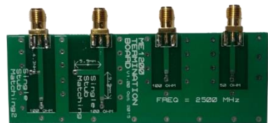
Termination board tuned at 2500MHz: