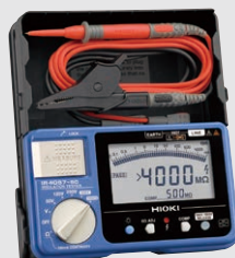
INSULATION TESTER IR4057-50