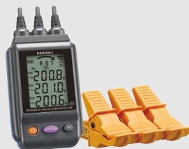
DIGITAL PHASE DETECTOR PD3259-50