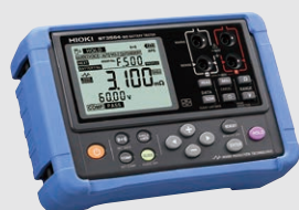
BATTERY TESTER BT3554-50