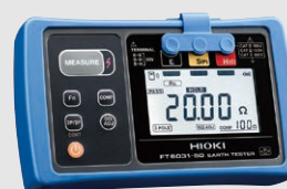
EARTH TESTER FT6031-50