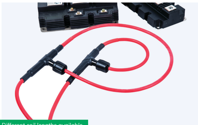
Different coil lengths available