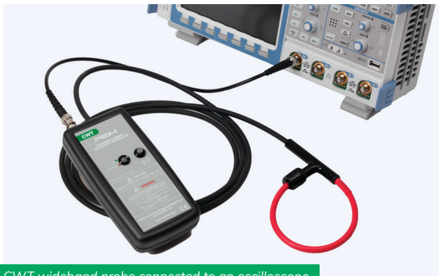
CWT wideband probe connected to an oscilloscope

The CWT and CWTHF combine an easy to use thin, flexible, clip-around Rogowski coil with an ability to accurately replicate fast switching current waveforms be they, sinusoidal, quasi-sinusoidal, PWM or pulsed.