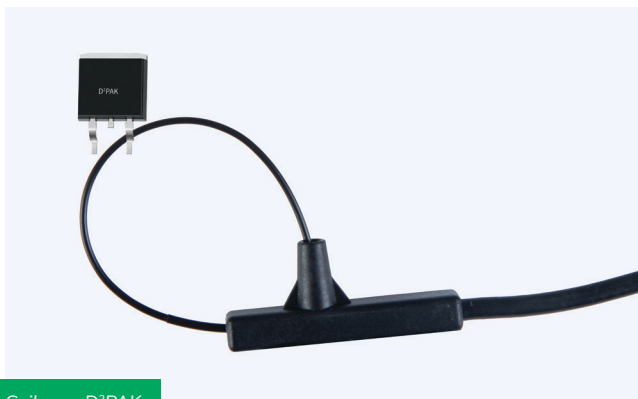
Coil on a D 2 PAK

The CWTUM-S is an even thinner version of the original CWT Ultra-mini probe from PEM. The Rogowski coil cross-section diameter is just 1.2mm without compromising operating temperature, high frequency performance or insulation voltage. Such a thin coil provides another solution for measuring current in tight spaces without disrupting the circuit under test.