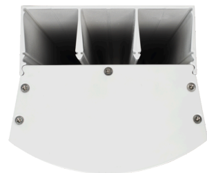
Cableway Option Available