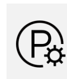
Parking Pay Station