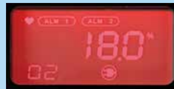
Danger screen (red)

Air pressure correction sensor incorporated in the main body ensures no fluctuation of the reading due to air pressure.