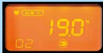
Caution screen (orange)