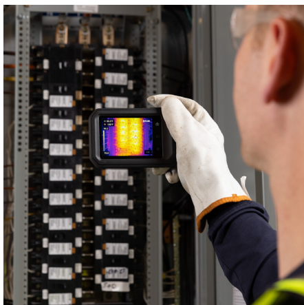
Cloud integration for streamlined workflow