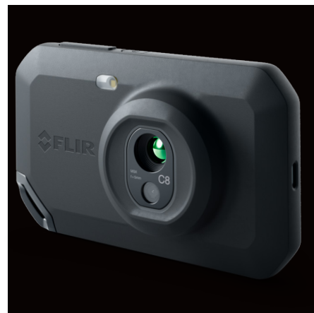
Compact, rugged design