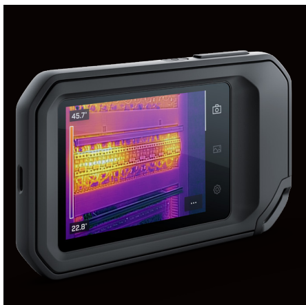
Enhanced thermal image quality